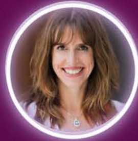
CAT COODE DATA AND PRIVACY STRATEGIST BINARY TATTOO